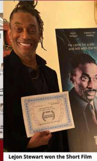
Award-winning actor Lejon Stewart at the Culver City Film Festival in Los Angeles